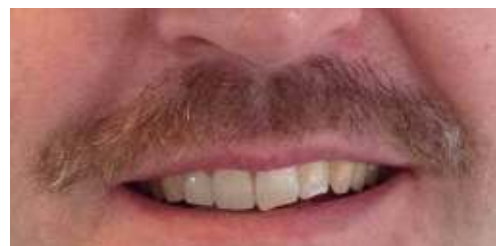
...and this one?

....and rule #2? – have a good breakfast!!