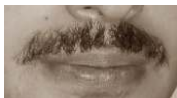
...Rhett? .... thought you'd shuffled off this mortal coile?