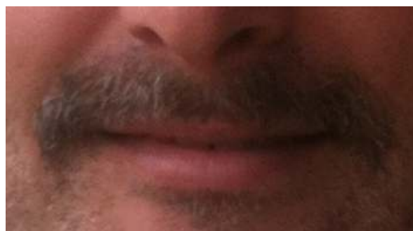
...ahh...Paul Newman's joined the band...?